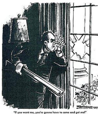
Figure 6: Nixon as a criminal

Hollywood movie scenes about criminals come into mind when we are looking at figure 6 with unfortunate President Nixon shouting: "If you want me, you're gonna have to come in and get me!" The scandalous resignation, Nixon's unwillingness to leave the White House, his desperate attempts to prove his innocence are presented as stubbornness of a criminal that has nothing to lose and thus label this behavioural type. Something of the kind we also find in Charles Adams' cartoon (Nash, Shelton, 1987). His heritage together with some creepy sense of humour can help to visualize elements of gothic style, particular vision of supernatural, the authorial image of a Victorian house (figs. 8, 9, 10), his traditional cast of characters – the "Addams Family" (figs. 10, 12), the situations that may form basis for "black" humour (fig. 11). It would help students to get a better understanding of the Gothic novel genre, to explain what stands behind such thrillers as "The Others", for example.