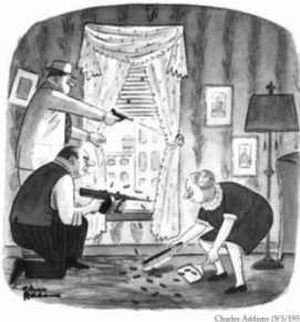
Figure 7: Charles Addams' cartoon