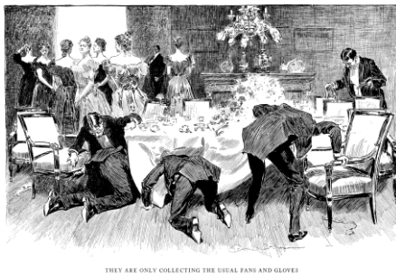
Figure 3: They are only collecting the usual fans and gloves

Charles D. Gibson would be followed by other illustrators, Harry G. Peter being one of them. It is he who would portray yet another popular new feminine type – Wonder Woman (fig. 4.). True, it was William M. Marston who identified the type. But it became possible only because such a type started appearing in American society; it was not only an allusion to mythology but a living type that hard years had brought into existence and cultivated.