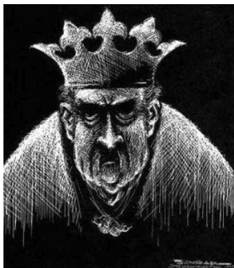
Figure 5: Nixon as King Richard II

Popular characters of folklore, literature, cartoons, films, etc. when being linked to certain people or situations in various types of discourse, including graphics make us be more attentive to certain works of art, help us recognize the elements that are important for a nation. Paul Conrad's creations give marvelous examples how literature, history and culture can be projected towards a politician. Figure 5. depicts Richard Nixon after the infamous Watergate Scandal, that led to his resignation, in the image of King Richard II as portrayed by William Shakespeare. The accompanying lines are: "O that I were as great as my grief, or lesser than my name. Or that I could forget what I have been. Or not remember what I must be now."