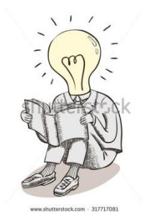
Figure 15: The bulb moment