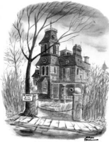
Figure 8: Victorian house