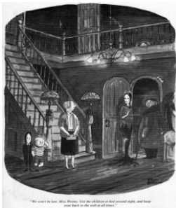
Figure 10: Addams Family