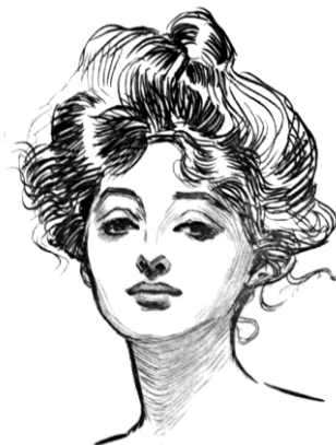
Figure 1: Gibson girl

The "Gibson girl" would serve as an example (fig. 1). According to the dictionaries, it is "a girl typifying the fashionable ideal of the late 19th and early 20th centuries. Origin: represented in the work of Charles D. Gibson (1867–1944), American artist and illustrator" (ABBY Lingvo, 2008). Immediately after her creation in 1890 this girl with her slender waist and luxurious hair has grown to be known as the personification of a feminine ideal. The Gibson girl blouse and the Gibson girl petticoats were all the rage.