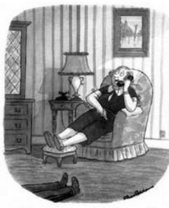
Figure 11: Addams Family