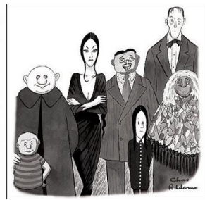
Figure 12: Addams Family