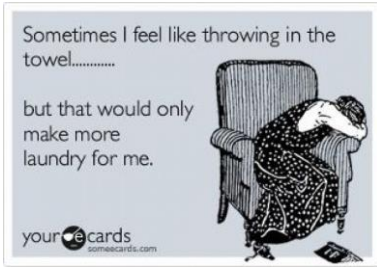
Figure 16: Making a choice