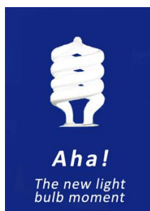
Figure 13: The new light bulb moment

Creolized texts that exist because of an idiom at their basis may be a very productive field for lexicology and lexicography classes. We often experiment with cartoons, caricatures, advertisements, sometimes video. Thus, to understand the transferred meaning that the drawing is based upon, the student would refer to various lexicographic information, then they would find contexts, make up their own examples, change grammatical constructions, etc. All this would help to practice the idiom. Figures 13, 14, 15, 16, 17 include idioms as such: the light bulb moment , the light bulb switched on , to throw in the towel and their transformations.