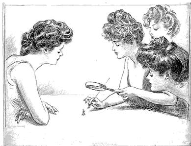
Figure 2: Gibson Girls examining a man

new women who amuse themselves looking through a magnifying glass at a man or indignantly and somewhat contemptuously contemplate how their partners are looking for their fans and gloves.