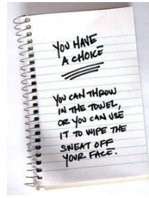
Figure 17: A piece of advice