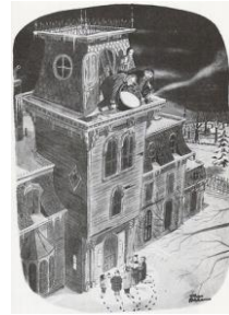
Figure 9: Victorian house