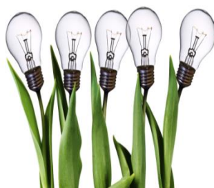
Figure 14: The rise of ideas